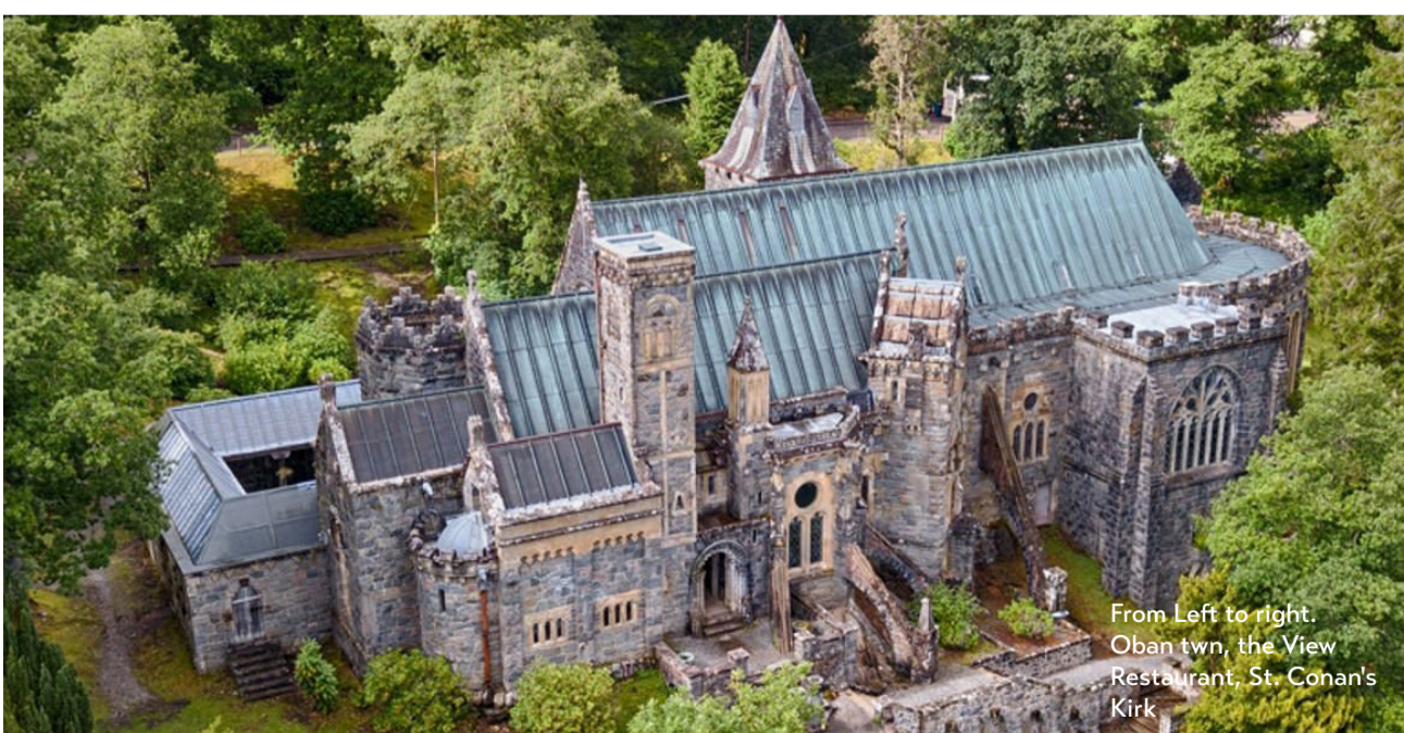
From Left to right. Oban town, the View Restaurant, St. Conan's Kirk

There might be time for a visit to the conservation village of Luss and if this has been a longer day for your clients why not consider an early dinner at the Loch Lomond Arms before returning to Glasgow and the hotel.