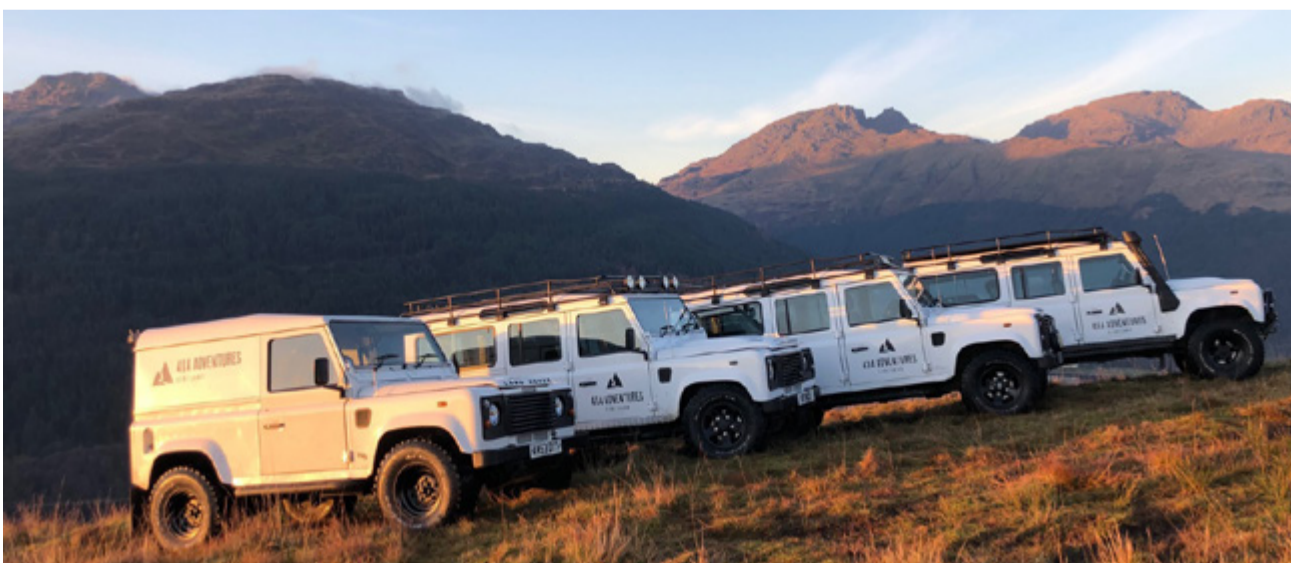
From Left to right. Cruise Loch Lomond 4x4 Adventures Scotland Destination Helensburgh

A wonderful day out from Glasgow with memories to last a lifetime.