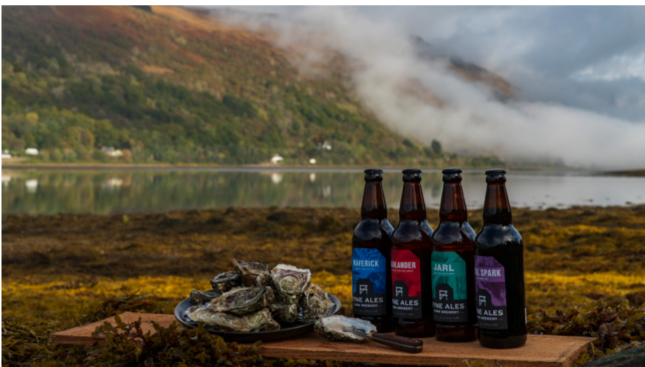
From Left to right. Loch Fyne Oyster Bar Benmore Gardens (VS) Fyne Ales Brewery

For all you need to know wildaboutargyll.co.uk | traveltrade@wildaboutargyll.co.uk