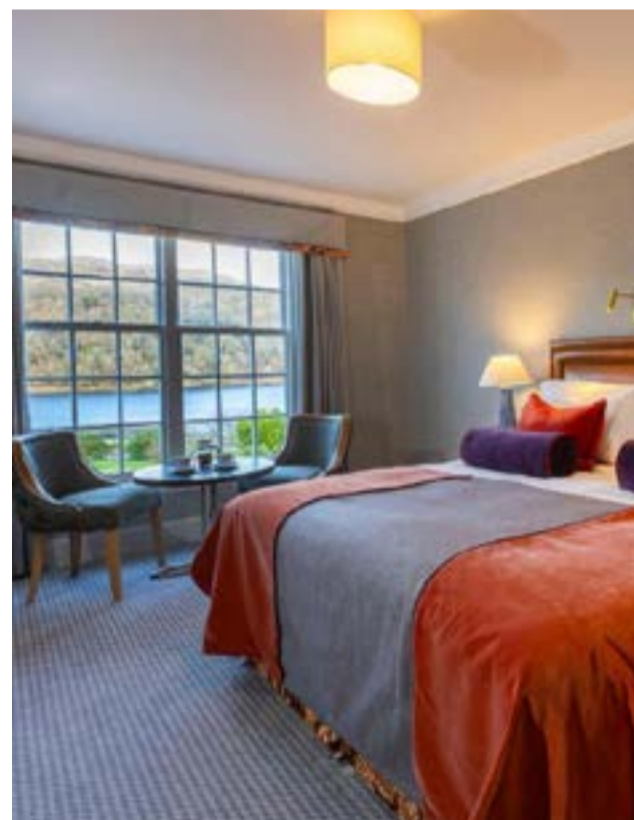
From Left to right. The Machrie Hotel & Links Port Ellen, Isle of Islay Knipoch House Hotel, Oban

Overnight can be at Knipoch House Hotel a cosy family-run hotel that combines modern luxury with a classic Scottish welcome.